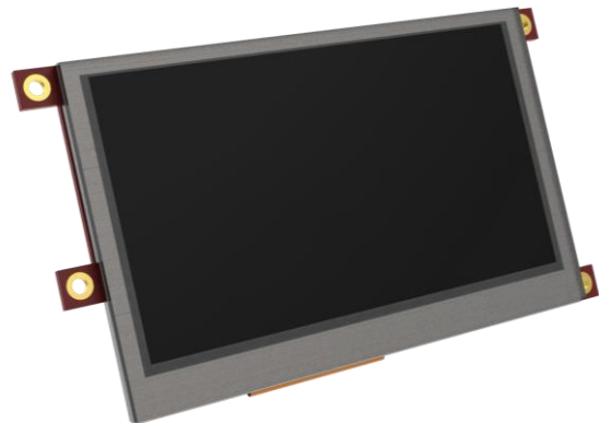
The uLCD-43-PT Display Module