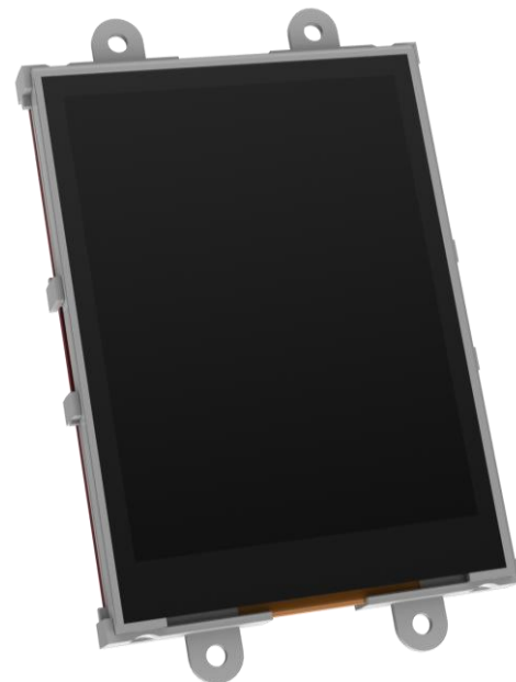
The uLCD-28-PTU Display Module